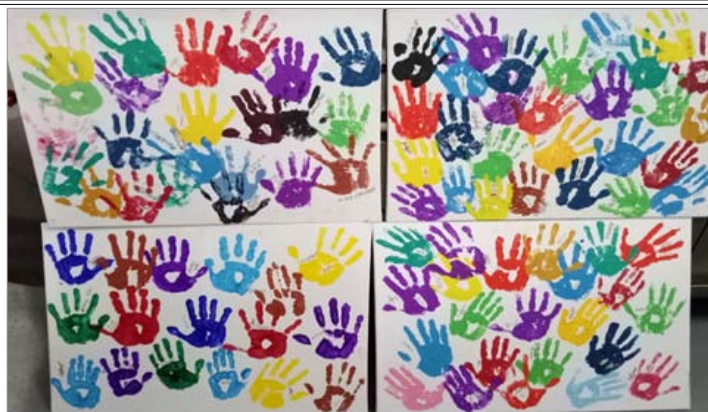
TnT Challengers' handprint symbolizing their "pledge of commitment to wellness".

The sources of fund from TnT will be as follows: