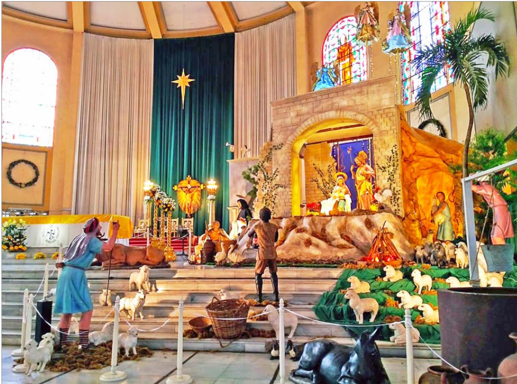
The Nativity Scene at Sto. Domingo Church, Quezon City, Philippines.