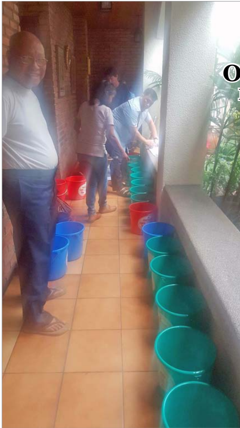
Outreach of Bahay Dominiko Community Preparing the Christmas give-aways to the indigents along the surrounding streets in Brgy. Sto. Domingo. December 21, 2017